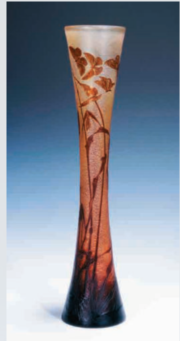
GALLÉ, Émile [1846-1904] “Engraved vase with design of oats and butterflies” 1890s

Opal and pink-tinged orange glass is laid over a transparent ground, followed by pear-colored glass imbedded with fine bits of white platinum and silica and topped with an overlay of dark brown glass. The motif of ripe oats and butterflies is executed with a combination of acid-etching and engraving. The design is marvelously adapted to the elongated pestle shape of the vase. Several slender oat stalks rise up from the ground in subtly curved lines, some bending sharply, and a flock of butterflies flits about on the lip which opens out gently. The bent stalks near the bottom cross each other in a complex pattern, but there is no sense that the motif has been unnaturally forced into a limited space. On the back of the vase, the overlapping heads of grain bow gracefully in the breeze. These curving stalks sinuous but sharply delineated. The long, thin whiskers of the oat husks emerging from the stalks and the feelers of the butterflies are made with trailing glass lines 0.5 mm (0.02") in diameter. The accomplished engraving technique that produced this delicate relief is one of the highlights of work produced by the Gallé glass factory.