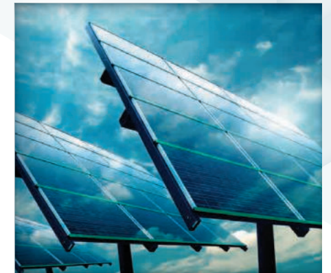
Renewable energy-related industries expected to grow in the future

In order to achieve decarbonization, there are great expectations for the development of environmental-related industries, including the conversion to renewable energy and Electric Vehicles (EV). In response to this trend, hybrid multi-tasking machine with friction stir welding (FSW) are increasingly being used to machine electrified automobile components. We will accelerate research and development to further improve performance considering the diversification of EV-related parts manufacturing.