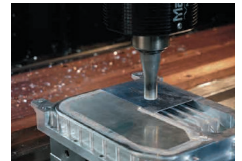
High-speed friction stir welding of aluminum cooling panels

Through these activities, Mazak will contribute to a carbon-free society and flexibly respond to changes in the industrial structure as well as providing optimum machine tools to all customers.