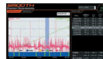
Smooth Energy Dashboard visualizes energy consumption of each machines

In collaboration with production sites around the world, we are constantly introducing new technologies and production processes to build and update environmentally friendly smart factories that minimize power consumption.