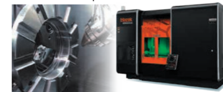
Hybrid multi-tasking machines achieve process integration, which results in the reduction of CO 2 emissions.

Furthermore, the hybrid multi-tasking machines incorporate technologies for AM (additive manufacturing), AG (auto gear) as well as Friction Stir Welding (FSW) help to reduce transportation costs, production lead time and even CO 2 emissions because they perform most or all of machining in one cycle. We are working aggressively to achieve lower CO 2 emissions of our products.