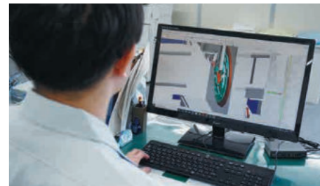
Production set-up time can be reduced with CAD/CAM software FX TUBE

The company then invested in the 5-axis machining center VARIAXIS i-800 and the double column vertical machining center FJV 5Face-60/120 after installment of the laser processing machines. "Sheet metal products have many parts that need to be machined, and until now they all depended on outsourcing. In-house production can reduce costs and shorten delivery times."