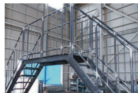
Iron stairs welded with long pipes and structural steels machined by a 3D laser processing machine

In 2022, they plan to introduce the vertical machining center MTV-655 / 80 and the CNC turning center QUICK TURN 300. "While having the final decision over price, we intend to get an advantage of processing of large, long structural