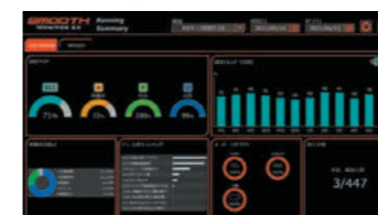
Smooth Monitor AX visualizes the operation status of entire factory