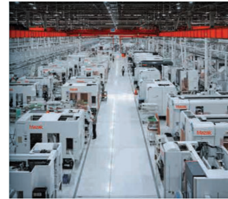
Approximately 30% reduction in CO 2 emissions at Minokamo Plant 1 through LED lighting, the latest air conditioning, and an energy management system

Aiming for an environmentally friendly company, we are working on resource-saving and energy-saving activities in the office such as improving work efficiency by utilizing digital technology, making it paperless and using LEDs. In addition, we are reducing the environmental impact associated with production activities by reducing energy consumption and industrial waste at our factories.