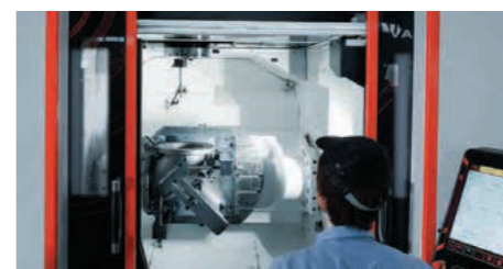
VARIAXIS i-800 enabled in-house production of machining that has been outsourced

For the 100th anniversary of the company in coming years, the company will steadily invest in system for further enhancement with an eye on the next generation.