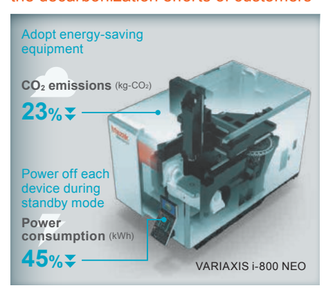
Contributing to customers' energy-saving efforts by further development of machines with lower power consumption

In product development, we are conscious of improving machine performance by developing new technologies and products to improve production efficiency, such as optimizing the power consumption of the entire machine and saving energy in peripheral equipment. For example, the VARIAXIS i-800 NEO has achieved a 45% reduction in power consumption and a 23% reduction in CO<sub>2</sub> emissions compared to conventional models. In addition, laser processing machines are switching from "CO<sub>2</sub> lasers" to "fiber lasers" that consume less power in all series. Some models have reduced power consumption by 80%.