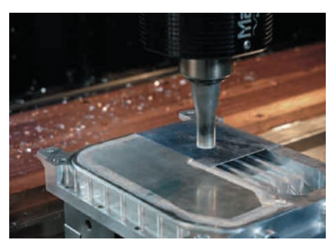
High-speed friction stir welding of aluminum cooling panels

Through these activities, Mazak will contribute to a carbon-free society and flexibly respond to changes in the industrial structure as well as providing optimum machine tools to all customers.