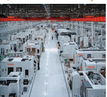
Approximately 30% reduction in CO_2 emissions at Minokamo Plant 1 through LED lighting, the latest air conditioning, and an energy management system

Aiming for an environmentally friendly company, we are working on resource-saving and energy-saving activities in the office such as improving work efficiency by utilizing digital technology, making it paperless and using LEDs. In addition, we are reducing the environmental impact associated with production activities by reducing energy consumption and industrial waste at our factories.